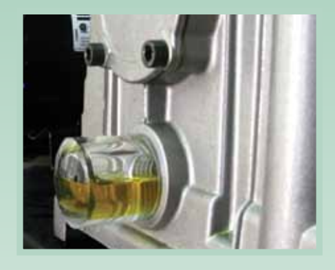
With Esco's 3-D BullsEye<sup>™</sup>, the reservoir oil can be inspected easily and accurately.