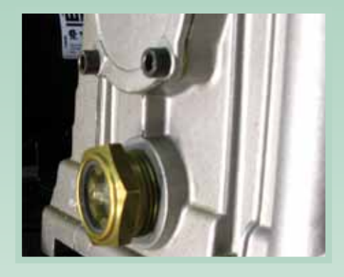
Old-fashioned sight plug make oil monitoring very difficult.